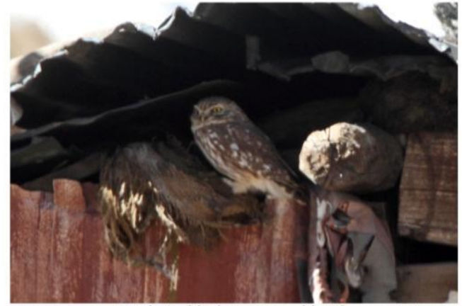
Little Owl (Athena noctua) by Chewang R Bonpo