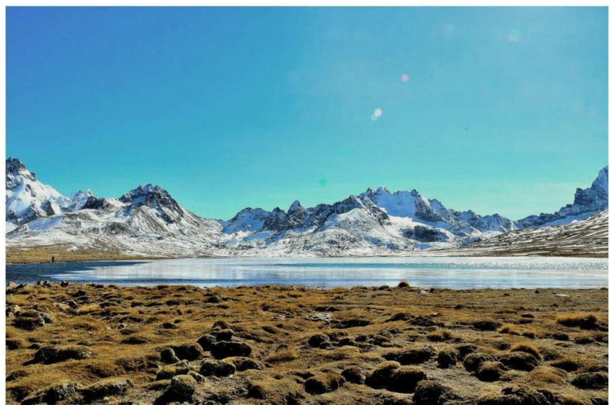
TSo Lahmo Lake -5,330 m (17,490 ft)

Sikkim plateau or Tso Lhamo Plateau –The Sikkim plateau is popularly known as TsoLahmo lies in the Trans-Himalayan region of the state, covering an area of about 400 sq. km and perhaps represents India's smallest biogeographic province (Rodgers and Panwar 1988). This province harbors populations of a few highly threatened mammalian fauna such as Snow Leopard (Uncia uncia), Pallas's Cat(Felis Manul) ,Tibetan argali (Ovis ammon hodgsoni), Tibetan gazelle (Procapra picticaudata) and southern kiang (Equus kiang polyodon). This area has also been the historical range of Tibetan antelope (Pantholops hodgsonii). The plateau also holds a good number of avian species like Tibetan Snowcock (Tetraogallus tibetanus), Bearded Vulture (Lammergeier) (Gypaetus barbatus), Himalayan Vulture (H Griffon) (Gyps himalayensis), Golden Eagle (Aquila chrysaetos), Tibetan Sandgrouse (Syrrhaptes tibetanus) and Ground Tit (Groundpecker, Hume's G) (Parus humilis) and many more, the plateau is also used extensively by the native Dokpa herders for livestock (yak and sheep) grazing. Compared to Ladhak, this plateau is reported to have higher densities of Tibetan argali and Tibetan gazelle but these populations are susceptible to decline due to heavy human influx and livestock grazing. Given the strategic location of this area for national security and stake of local communities for pastures, this area would need more attention for conservation