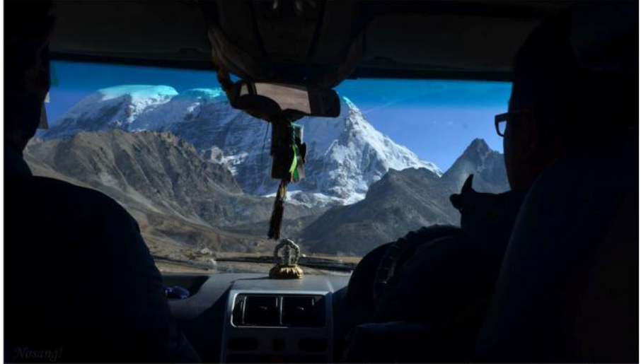
Scenic Drive in the Plateau