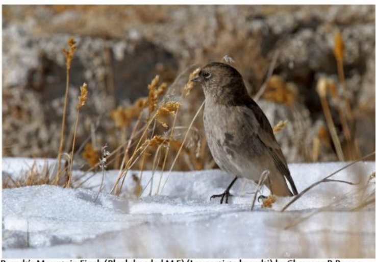
Brandt's Mountain Finch (Black-headed MF) (Leucosticte brandti) by Chewang R Bonpo