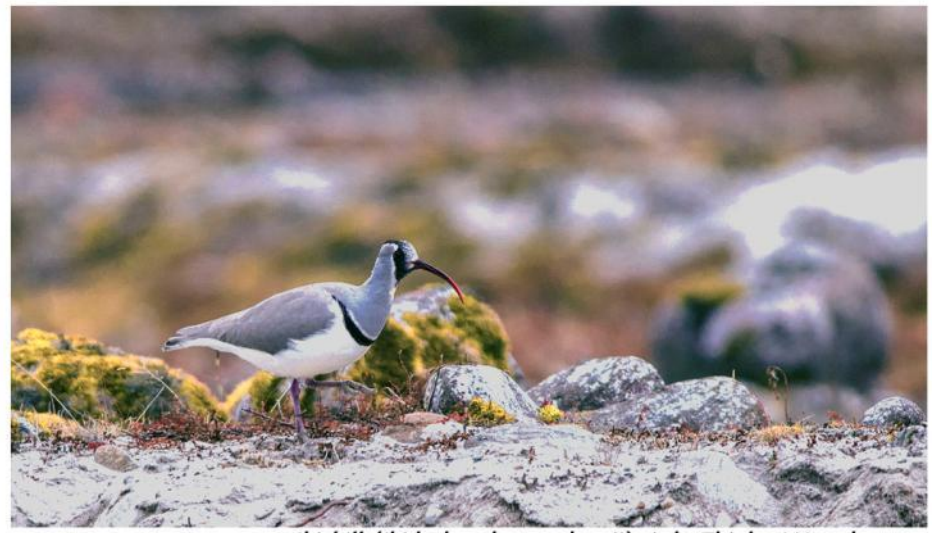
Ibisbill (Ibidorhyncha struthersii)