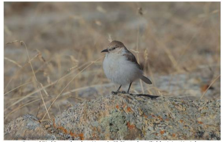
Ground Tit (Groundpecker, Hume's G) (Parus humilis)