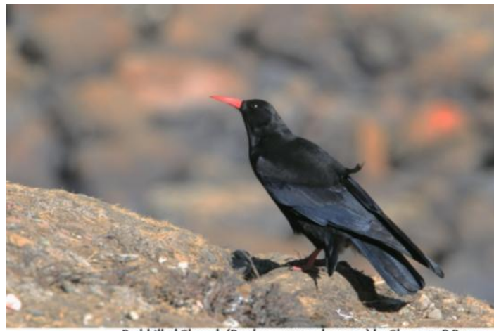
Red-billed Chough (Pyrrhocorax pyrrhocorax) by Chewang R Bonpo