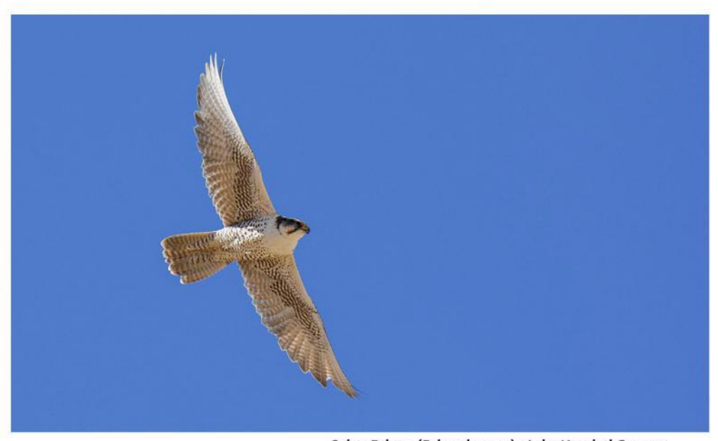
Saker Falcon (Falco cherrug)