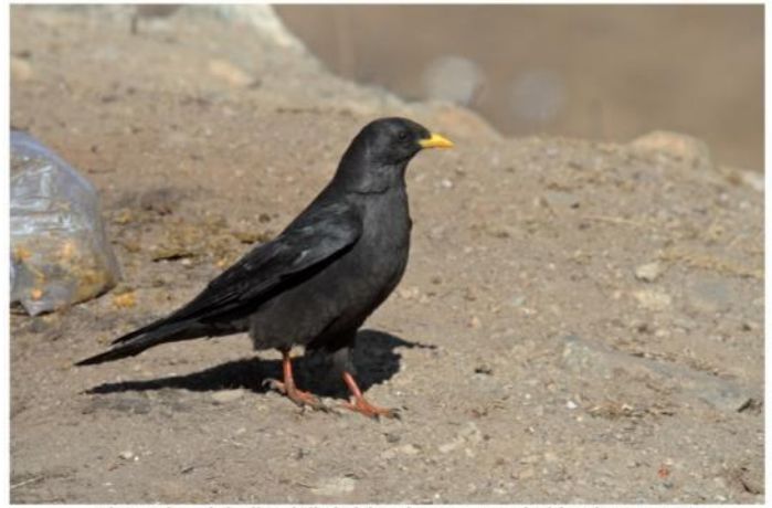
Alpine Chough (Yellow-billed C) (Pyrrhocorax graculus) by Chewang R Bonpo