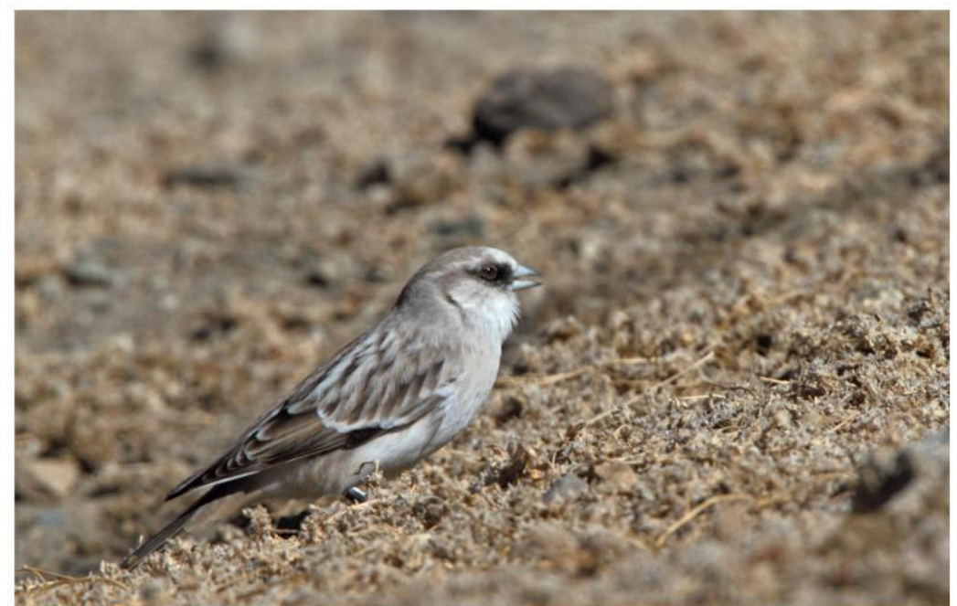
White-rumped Snowfinch (Pyrgilauda taczanowskii) by Chewang R Bonpo

The fourth day of the tour was spent in Yumgthang and Yumesamdong area of Lachung with the following species of the birds such as Grandala ( Grandala coelicolor ) (around 100 individuals in flock of 4), White-throated Redstart ( Phoenicurus schisticeps ) a group of five to six birds (seems to be migrating down to low altitude), a pair of nesting Himalayan Griffon Vulture (Gyps himalayensis), an Individual of Golden Eagle ( Aquila chrysaetos ), Ibisbill ( Ibidorhyncha struthersii ) (four birds) in Yumthang River followed by 4 individuals of White-throated Dipper ( Cinclus cinclus ) (two sub-adult birds), a couple of Black-face Laughingthrush ( Trochalopteron affine ), a dozen of Coal tit ( Periparus ater ), Rufous vented Tit ( Periparus rubidiventris ), Grey-crested Tit ( Lophophanes dichrous ) and Goldcrest ( Regulus regulus himalayensis ).