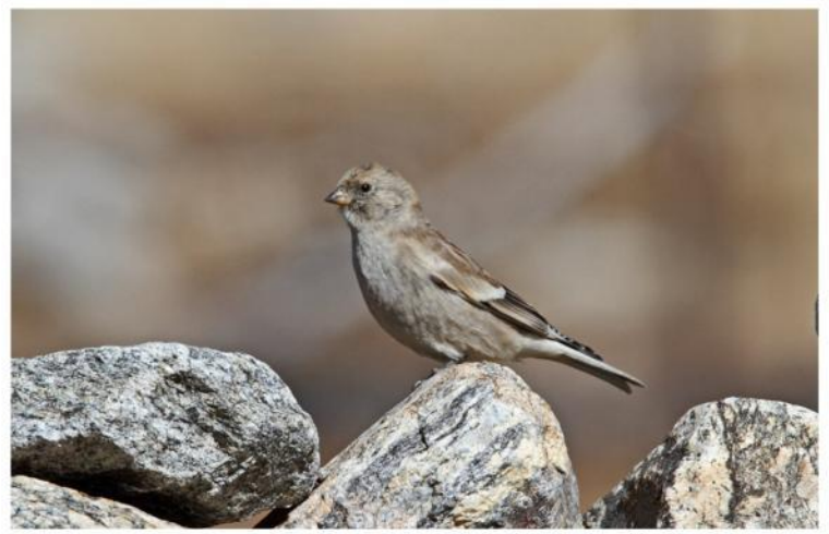
Tibetan Snowfinch (Montifringilla adamsi)