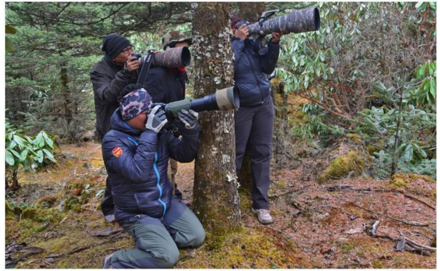
The Team in Yumgthang Valley