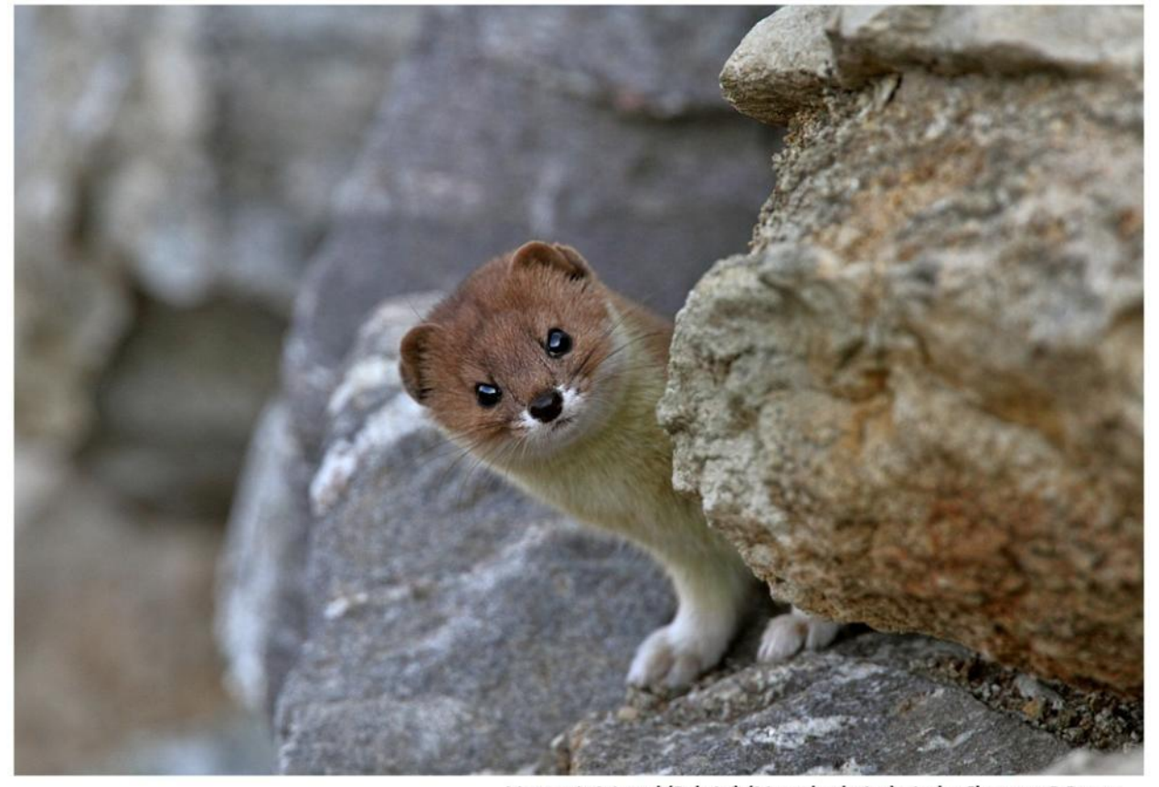
Mountain Weasel (Pale W) (Mustela altaica)

Faunal Survey of Sikkim plateau (Trans-Himalaya), Yumthang Valley & Yumesamdong (North Sikkim) Date: 12<sup>th</sup> November to 15<sup>th</sup> November 2014