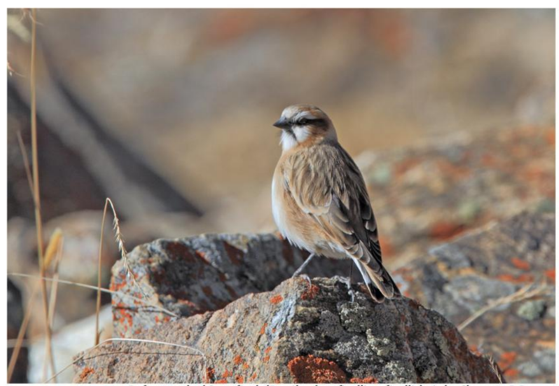
Rufous-necked Snowfinch (Pyrgilauda ruficollis ruficollis)

The third day of the tour started with the early morning drive towards Tso Lahmo Plateau 5,330 m (17,490 ft). On reaching we got to see the heavenly view of the lake which was glittering at its best. The bird species that we sighted in the Plateau was a dozen of Rufous-necked snowfinch ( Pyrgilauda ruficollis ruficollis ) followed by more than hundred White-rumped Snowfinch ( Pyrgilauda taczanowskii ), (some of the individuals with courtship display), a dozen of Ground Tit (Groundpecker, Hume's G) ( Parus humilis ) were seen on feeding on the ground, countless number of Horned larks ( Eremophila alpestris ) with juveniles birds was also seen feeding on roadsides, three individual of Güldenstädt's Redstart (White-winged R) ( Phoenicurus erythrogaster ) was seen in different location, Brandt's Mountain Finch (Black-headed M F) ( Leucosticte brandti ) and Tibetan Snowfinch (Adams's S) ( Montifringilla adamsi ) was found to be common in Tso Lahmo Plateau, a pair of Saker Falcon ( Falco cherrug milvipes ) with a successful kill of the Tibetan snowfinch, Alpine Chough ( Pyrrhocorax graculus forsythi ) & Red-billed Chough ( Pyrrhocorax pyrrhocorax himalayanus ) was commonly seen in garbage dumped area, a pair of Golden Eagle ( Aquila chrysaetos daphanea ) flying in a distance. The mammals like Tibetan Fox ( Vulpes ferrilata ) (a individual sighted in Thangu in late eveining) was also sighted in Tso-Lahmo and Tibetan Woolly Hare ( Lepus oiostolus ).